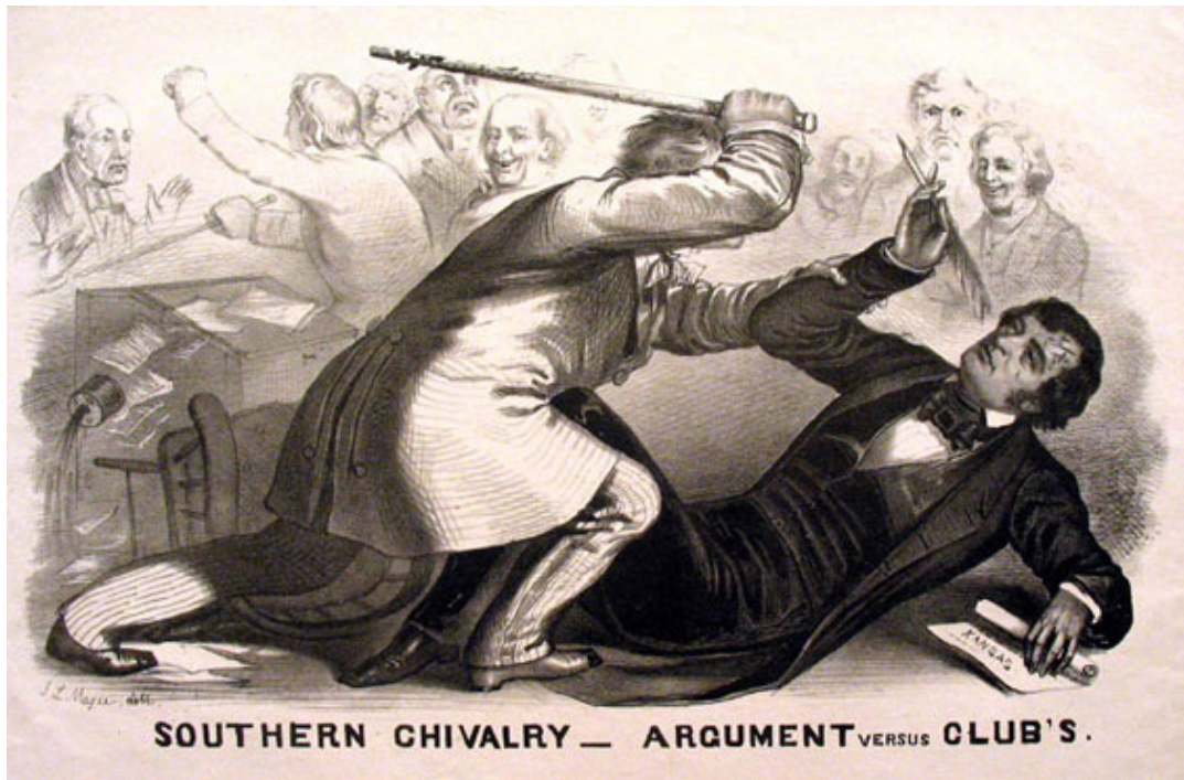
SOUTHERN CHIVALRY — ARGUMENT VERSUS CLUB'S.